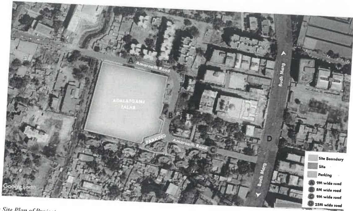
Figure 1 : Site Plan of Project