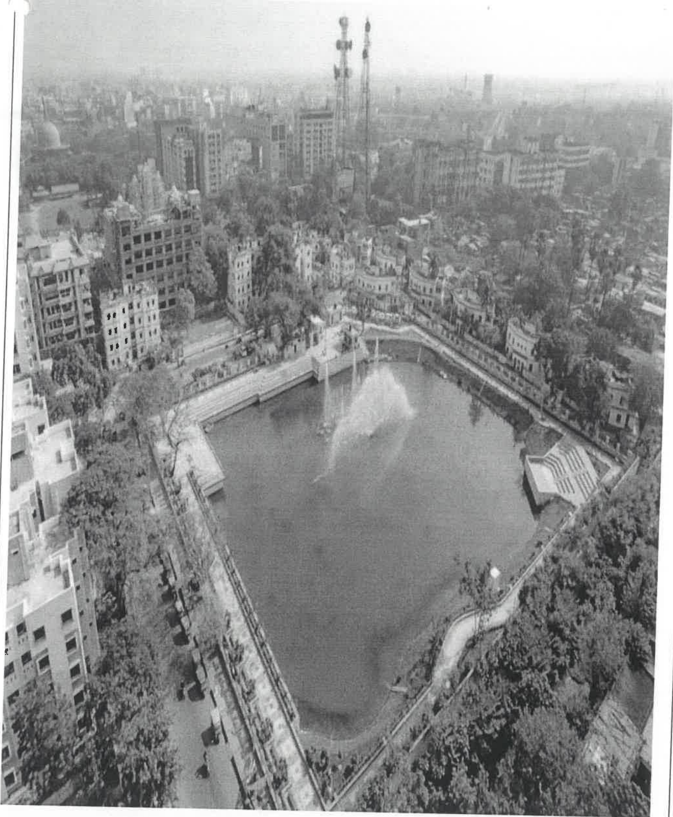
Figure 2: Site Photo